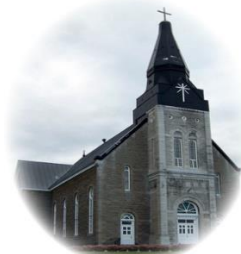
ST MARGARET OF SCOTLAND/ STE-MARGUERITE D'ÉCOSSE Glen Nevis