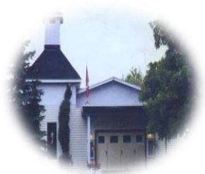
SAINT JOSEPH / SAINT-JOSEPH Lancaster