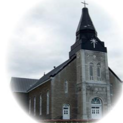
ST MARGARET OF SCOTLAND/ STE-MARGUERITE D'ÉCOSSE Glen Nevis