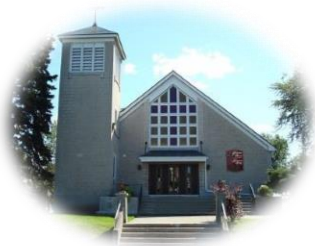
PRECIOUS BLOOD / PRÉCIEUX-SANG Glen Walter