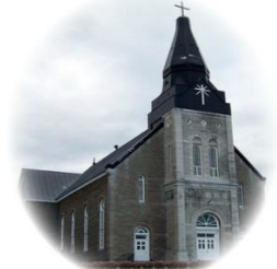
ST MARGARET OF SCOTLAND/ STE-MARGUERITE D'ÉCOSSE Glen Nevis