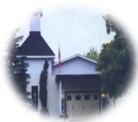
SAINT JOSEPH / SAINT-JOSEPH Lancaster