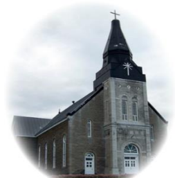
ST MARGARET OF SCOTLAND/ STE-MARGUERITE D'ÉCOSSE Glen Nevis