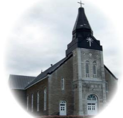
ST MARGARET OF SCOTLAND / STE-MARGUERITE D'ÉCOSSE Glen Nevis